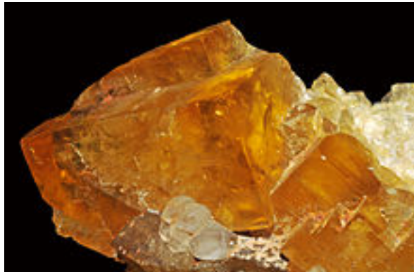
Fluorite Crystal – Wikipedia https://en.wikipedia.org/wiki/Fluoride